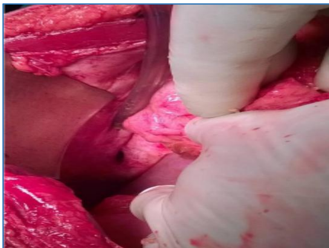
Fig. 4: Intraop Picture showing Defect with Herniation