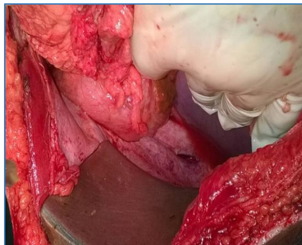
Fig. 2: Intraop Picture showing Defect