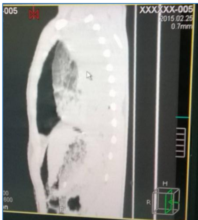
Fig. 1: CT Abdomen showing Pneumothorax with Pneumoperitoneum

CXR: Lt haemopneumothorax, CT: Lt haemopneumothorax with pneumoperitoneum and free fluid in pelvis. Intraop: 5*2 cm defect in left dome of diaphragm with 2*1 cm gastric tear with herniation of omentum into the pleural cavity. Contents reduced and defect closed with 1 prolene primary closure of Gastric tear done. Lt ICD inserted, pt. recovered well.