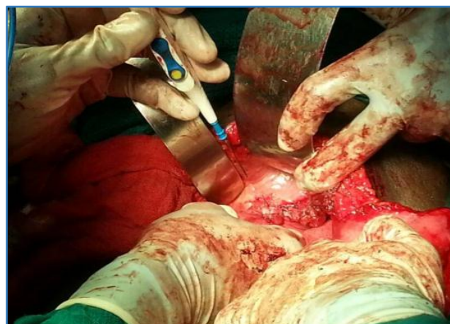
Fig. 3: Intraop Picture showing Repair of Defect

CXR: NAD. CT Abdomen: Pneumoperitoneum with free fluid in pelvis. Pt was taken up for laparotomy intraop: 3*1 cm defect in left dome of diaphragm with a 2*1 cm tear in descending colon. Primary closure of diaphragmatic defect was done using 1 prolene. Primary closure of descending colon tear done, Lt ICD inserted, pt recovered well.